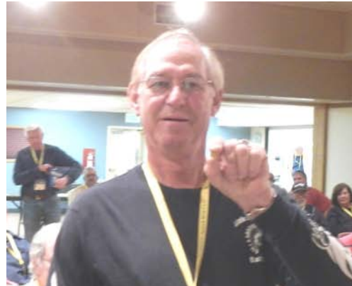
Drawing tickets are $1 each, take a chance.

Baseball caps with the Eureka! Logo are available for $10.00. Metal detector lapel pins are $5.00 and Eureka! window decals are $2.00.