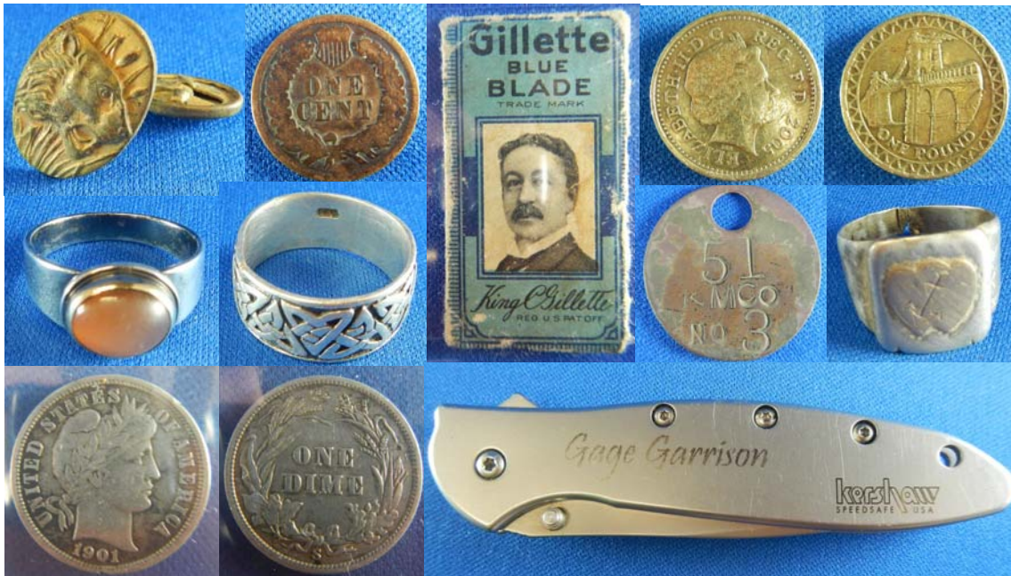
Some of the Find Of The Month entries for October